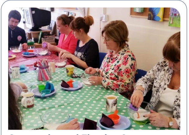
Community and Floating Support

Antrim, Carrickfergus, Banbridge, Belfast, Kilkeel, Inverary House