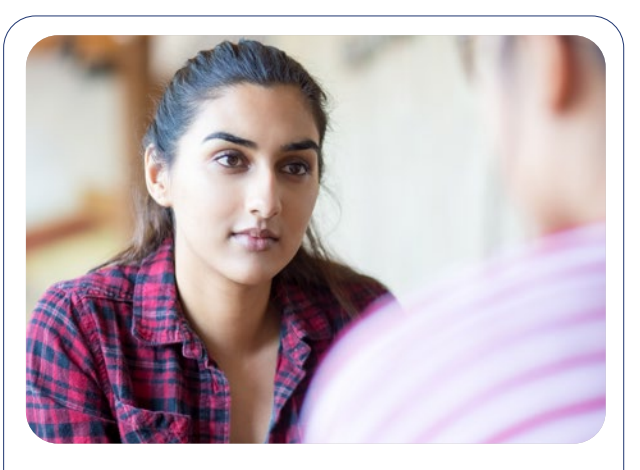
Community Bridge Building Northern Health and Social Care Trust