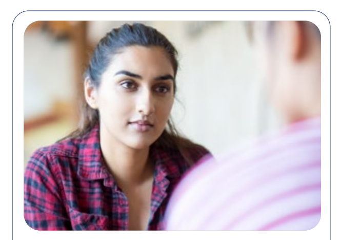
Community Bridge Building